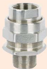
Steel pipe wiring